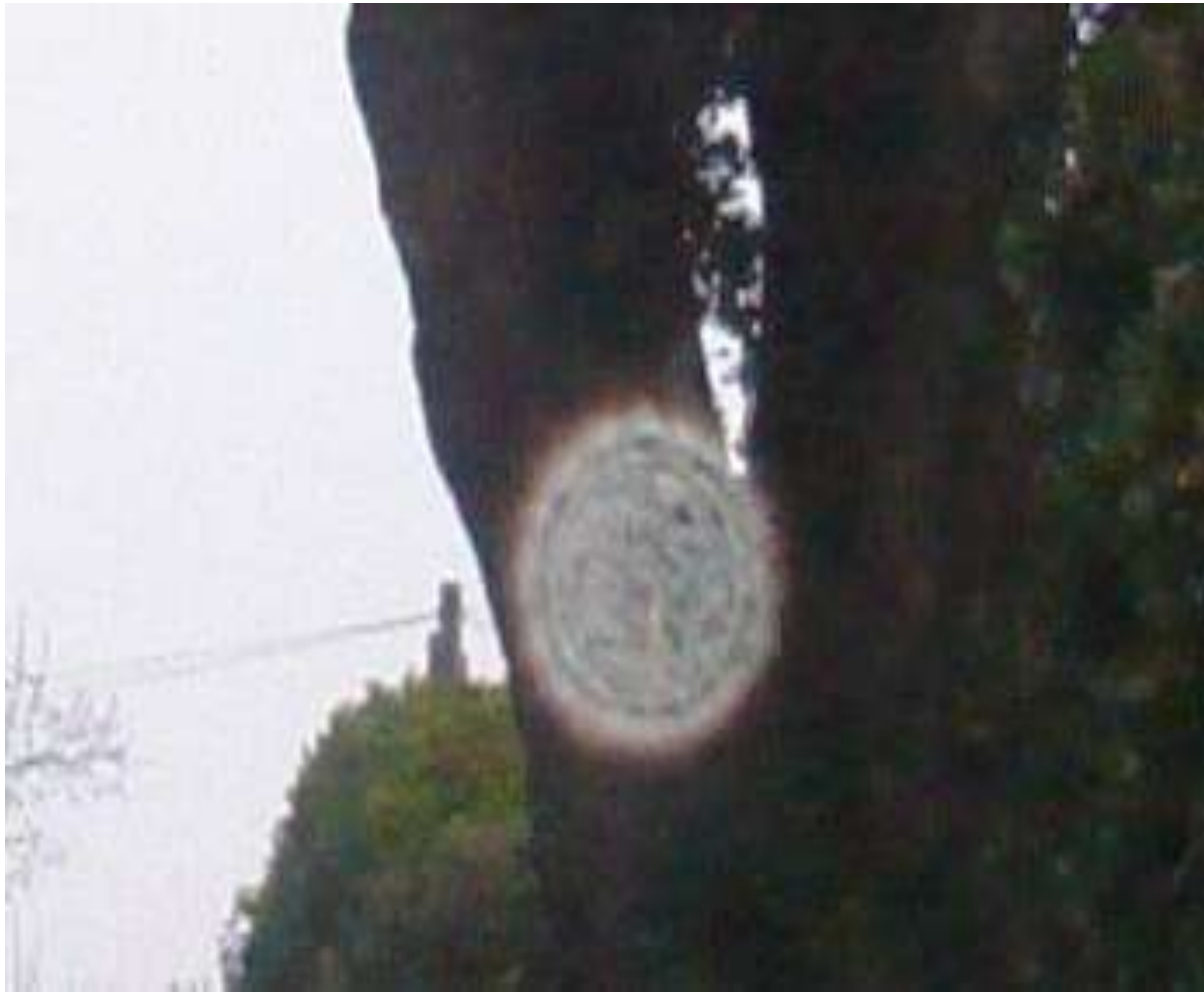
A face exhibiting 3-diemnsionality is clearly visible in the above example taken at dawn outside: again Lorna had made specifically a request for the EL-