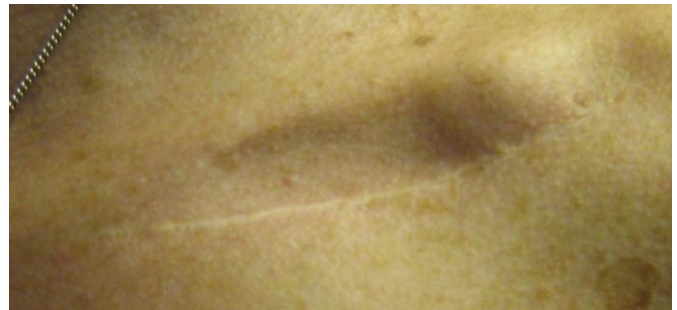
After the work has been completed

Once the scar itself has been released, the deeper layers of the soft tissue beneath and around it need attention. The connective tissue (fascia) of the body will 'stick' to itself (like cling film when it gets in a mess) creating 'adhesions'. We are all used to the idea of local adhesions but in fact, because the deeper layers of fascia create a connecting network around the whole body, any localised adhesions can have a domino effect through the body, creating restriction and, long-term, pain. Long term, the fascial pull may create chronic tension deep within us, affecting the functioning of the organs and bodily systems plus lowering our energy level and affecting how we feel day to day. We often put the general lack of wellbeing down to age, whereas in fact the issues I've talked about so far can usually be corrected through appropriate bodywork or through body psychotherapy. A Caesarean scar of twenty years ago can be a contributing factor in low back pain, or knee pain, today.